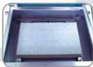
毛刷 Washing Brush