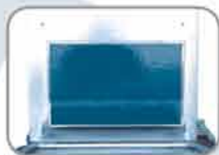
柔版自動粘貼平臺 Flexo automatic adhere plat