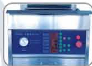
控制面板 Control panel